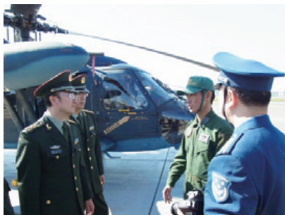
Group members observing at a Japan Maritime Self-Defense Force (JMSDF) base during their Japan visit