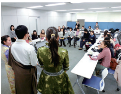
Exchange meeting with Waseda University students