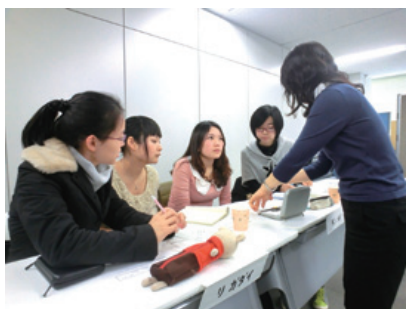
Lesson in progress

overall curriculum included special lectures on Japanese culture, a one-day homestay program, educational visits to local areas, and a trip to Kobe and Kyoto. On arriving back in Beijing, follow-up activities were then provided and reports written by project participants about their experience of training in Japan were compiled into a booklet.