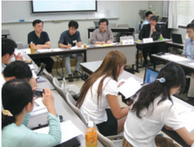
The seminar in progress

The aim of this project is to promote sharing of information on trends in historical research as well as on problems in the perception of history and other issues among young historians from Japan and China in order to strengthen the network of researchers in this field. In August 2011, it hosted the Japan-China Young Historians Seminar at University of the Ryukyus in Japan. A total of 39 history researchers from both countries participated, and 14 lectures were provided by leading researchers and 23