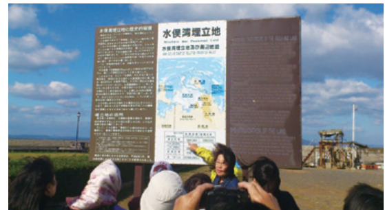
Group's visit to Minamata, Kumamoto Prefecture as part of their training tour of Japan

people in charge of the project visited Guilin and held a joint general session with the Guilin Municipal Health Bureau, other local administrative bureaus, and health volunteer group representatives. The project's achievements were presented at the session to the local public, including local administrative, health and education bureaus and residents, and were also covered by the media.