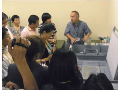
Participants being briefed on operating a machine used in document restoration

research presentations were given by training participants. The project also invited three research experts on mainland China to the International Conference of the 1911 Revolution in Tokyo and Kobe to further strengthen support for research exchanges between the two countries.