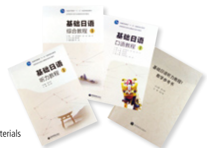
Some of the teaching materials developed to date

specialists in collaborative editing conferences held in Beijing and Luoyang, as well as the cost of bringing Chinese textbook authors to Japan for a similar conference held in Tokyo. SJCF also provided support for Japanese instructors sent to China to observe use of the teaching materials in monitored lectures, in order to provide regular feedback to the authors on their effectiveness.