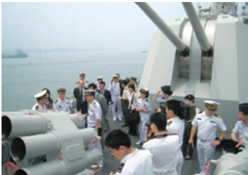
Chinese PLA officers visiting Japan.

field officers visited China as part of the 10th such group, which numbered 30 people in total, including 4 people from past groups, advisors, and staff related to the project.