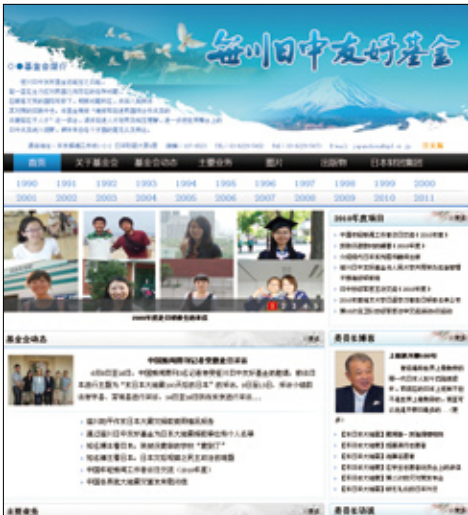
The SJCF Chinese-language Website

This project aims for ongoing use of the Internet to introduce current SJCF projects and to follow up on projects that have been completed to date. The purpose of this project is to enhance sharing of information about the activities of the Fund throughout China. The website was built in fiscal 2009, and it has been posting information in Chinese on fiscal 2010 projects and their results. New content was also created introducing China-related projects conducted by The Nippon Foundation and affiliates.