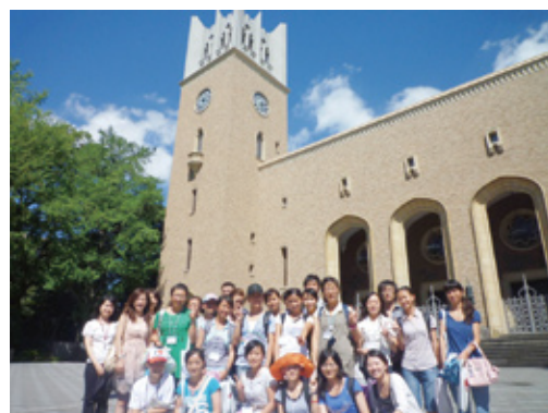
Japanese language students from regional Chinese universities participating in the training program

provinces, along with a teacher to lead the group. The students subsequently received training for about one month at the Waseda University Center for International Education.