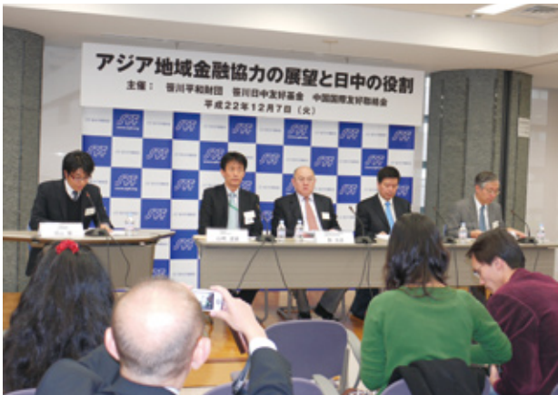
International symposium in progress

international finance. In Japan, exchanges were conducted with their Japanese counterparts and other specialists.