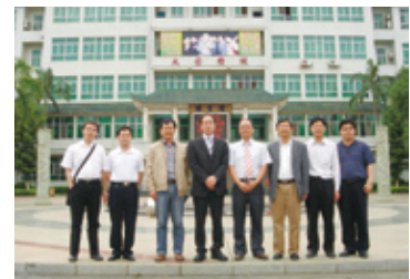
Participants in the East Asian Congress of Health Promotion

among farming families and in health and hygiene. Lectures were also held on forming volunteer groups. Volunteer groups from Guilin who had received training from specialists were also sent to attend the East Asian Congress of Health Promotion held in Shanghai in November, 2010, as part of efforts to support participation in such exchange activities.