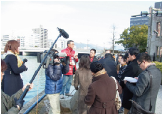
Journalists on a guided tour in front of the Hiroshima Peace Memorial Museum

This project encourages a deeper understanding of Japan, and the building of a life-size portrait of Japan for the Chinese people. In the three years since fiscal 2008, 37 young Chinese journalists have been invited to Japan to participate in training designed to promote a better understanding of Japan. In the first year, 11 individuals visited Tokyo, Hiroshima, Kyoto, Kobe, and Osaka, with a focus on the theme of Japanese culture. The second year saw a group of 14 individuals visit Tokyo and Hokkaido to learn about the politics and the economy in Japan. In fiscal 2010, the final year of the project, 12 participants were invited, and traveled to Tokyo, Okinawa, and Hiroshima.