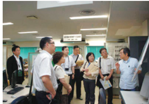
The study team visiting Japan

the Sichuan Earthquake were invited to Japan for training. In fiscal 2010, specialists from Japan and China cooperated in the development of a training program, and together with experts in disaster prevention from both countries, provided instruction. The subsidized project utilized materials accumulated in the course of the seminars to set up a disaster prevention information website, the China and Japan Disaster Info and Action International Network ( http://www.asiabosai.net ), which was then used to disseminate the results of the project.