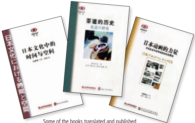
Some of the books translated and published under this project

began making selections. A total of 10 volumes were translated and published in China in fiscal 2010, including Time and Space in Japanese Culture and The History of the Tea Ceremony .