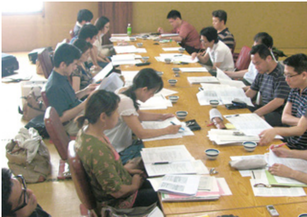
Project members attend an editing meeting

For this project, experts in Japan are summarizing Japan-China relations in the 40 years between 1972 and 2012, with the goal of presenting a general portrait of Japan-China relations up to the present to the peoples of both countries. In fiscal 2010, editing work was begun on the project, tentatively titled Forty Years of Japan-China Relations in Review (1972–2012) . Specifically, authors were selected, a chapter structure for the publication finalized, and a general outline developed for the content to be incorporated. A total of 60 authors were selected for the project, including 16 for the section on politics, 33 in economics, and 11 for the section on culture and society.