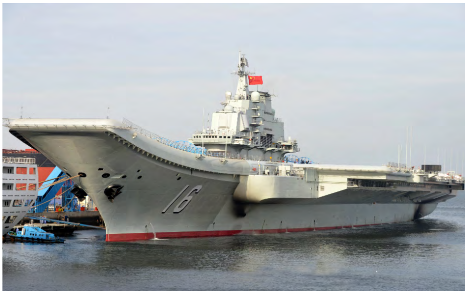
China's first carrier, the Liaoning

http://news.xinhuanet.com/english/china/2012-09/25/c_131871538.htm