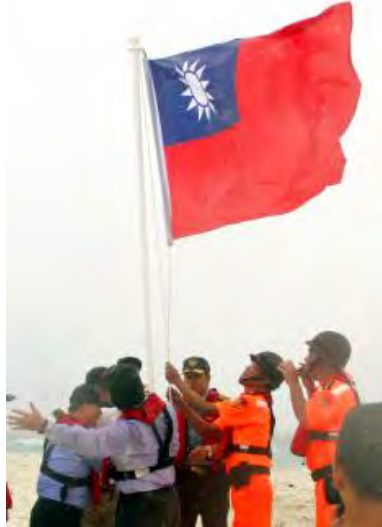
The flag-raising ceremony in Taiping Island.