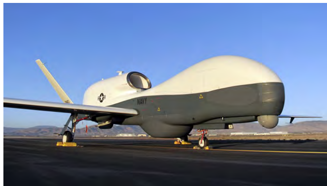
Guam to become forward base for MQ-4C (BAMS) drones in the Pacific

http://defense-update.com/20120917_uas-on-maritime-surveillance-pacific.html