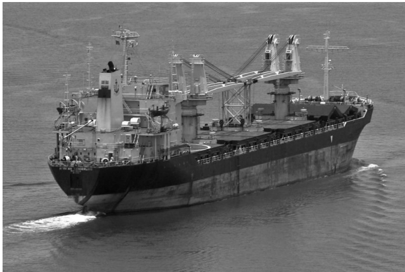
MV African Sanderling (58,798DWT)

On the 15th, Somali pirates hijacked a bulk carrier flying a Panamanian flag, MV African Sanderling (58,798DWT), in the Gulf of Aden. Operated by the Philippines, the bulk carrier was sailing from the Middle East to Asia with 21 crew members when it was seized. According to the International Maritime Bureau (IMB), this latest hijacking brings the number of attacks in the maritime areas of the Gulf of Aden and Somalia in 2008 to 83 and a total of 29 ships have been hijacked.