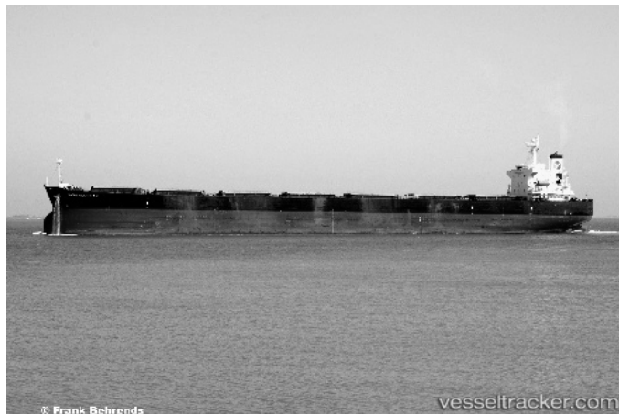
MV Yasa Neslihan (8 万 2,849DWT)

http://www.vesseltracker.com/en/ShipPhotos/8019-Yasa-Neslihan-9286566.html