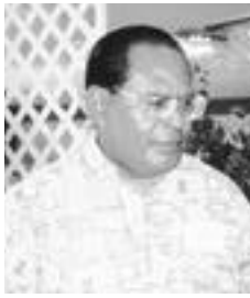
Mr. Masao Ueda, Palau's Minister of Health