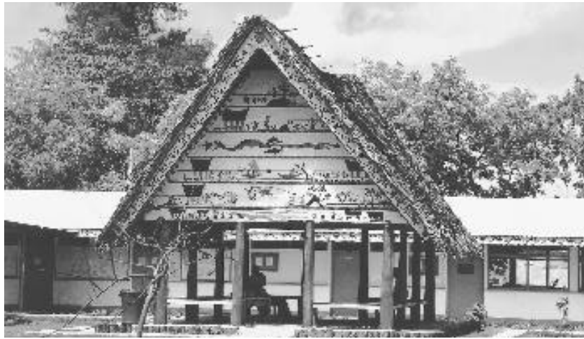
a Bai, a traditional meeting house, established within the Palau Community College

"Palau is blessed not only by the natural environment. The history and traditional culture of Palau are also attractions that bring tourists here. How about a Palau Eco Culture Tour? But alas there are so few flights