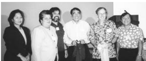
Staff of the Education Ministry of Saipan and Guam responsible to promote E-Rate activities