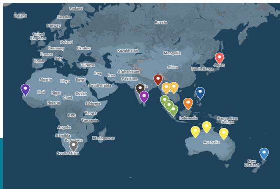
ANEMONE Global Participating Countries and Sampling Sites