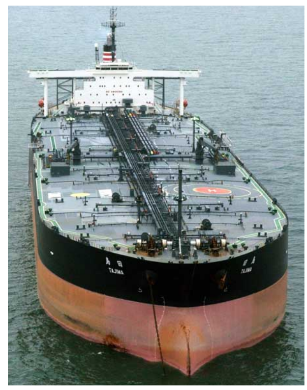
Tanker Tajima

The problem was that the fact that the incident had occurred on the high seas was emphasized too much, and little attention was paid legally to the facts that the tanker was anchored in a Japanese port in the internal waters of Japan and the murder case had a serious impact on Japan.