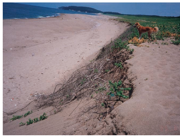
On the Shioya beach in Kaga City, the roots of seaside plants withered from the effects of oil and the shoreline are being eroded. (The photograph was taken in June 2000.)

(Ship & Ocean Newsletter No.44 June 5, 2002)