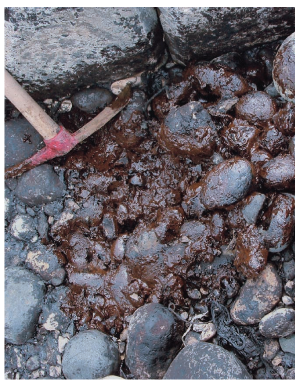
If you dig the cobble beach, oil residues are exposed. This condition persists today.

Before dawn on Jan. 2, 1997, the Russian tanker "Nakhodka," loaded with heavy fuel oil, sank in the Sea of Japan. The body of the tanker broke in two, the stern sank in deep water at a point 2,500 m off the coast of Oki Island, Shimane Prefecture, and the bow drifted to the sea off Anto Point, Mikuni Town, in Fukui Prefecture. Although oil recovery and removal operations were performed, masses of oil clots drifted ashore on the coasts of nine prefectures, most heavily on the beaches in Fukui and Ishikawa Prefectures. It was Japan's most serious oil spill accident, in which an estimated amount of 8,660 kl of heavy oil spilled to the sea. Many volunteers cooperated to remove the oil, rescue seabirds and do other types of cleanup work. From February toward the end of May, coastal municipalities successively issued statements that the situation was under control and the beach cleanup was almost complete. This situation made the volunteers desiring to continue the