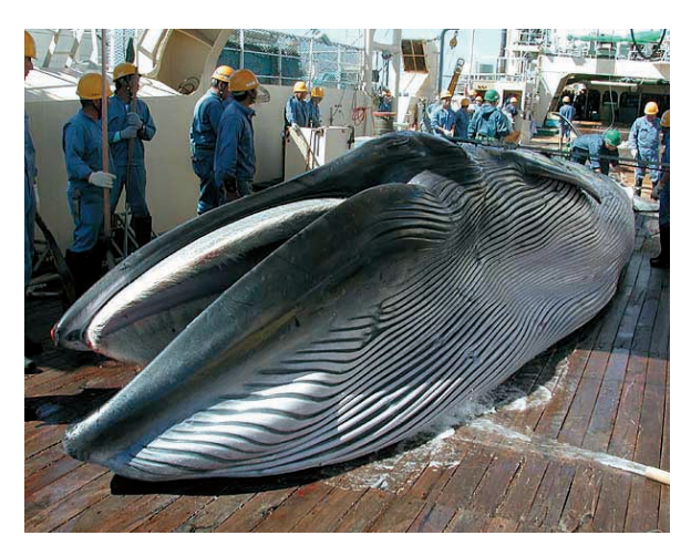
A Bryde's whale caught in Japan's research program. The length, weight and other physical dimensions are measured for morphological studies. The contents in the stomach are analyzed and other scientific studies conducted.

It must also be pointed out that with greatly advanced scientific knowledge about whales and wildlife manage-