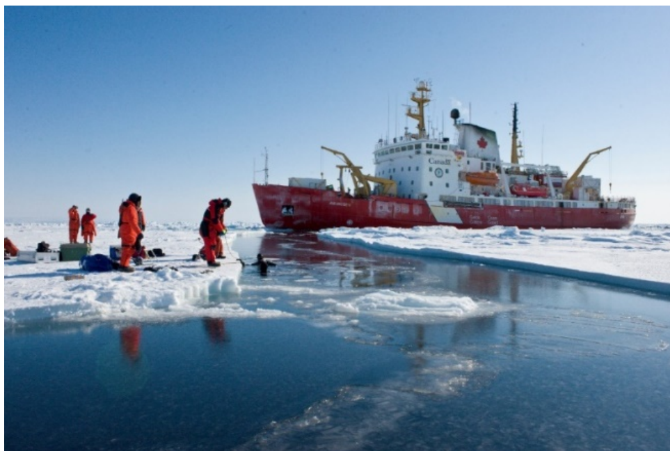
Figure 3: The Canadian Coast Guard's academic research icebreaker Amundsen

international cooperation in Arctic Ocean observation.