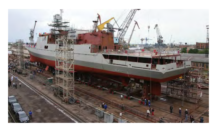
India formally commissioned a new frigate INS Teg into its navy at a shipyard in Kaliningrad.

Refer to the article: Russian-Built Frigate Joins Indian Navy <a href="http://en.ria.ru/mlitary_news/20120427/173085034.html">http://en.ria.ru/mlitary_news/20120427/173085034.html</a>