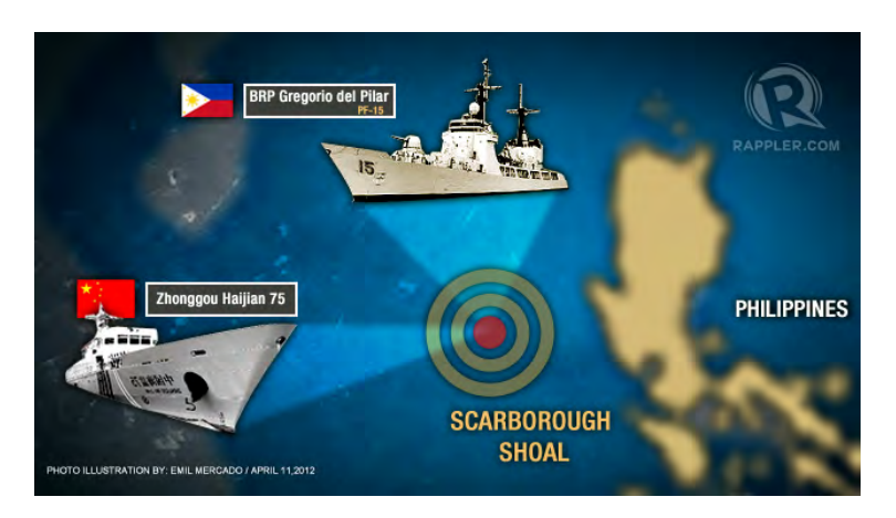
DISPUTED: The Panatag (Scarborough) Shoal

Since April 8, the Philippines and China have continued confronting over Scarborough Shoal in the South China Sea. Below summarizes the whole picture of the incident with a variety of sources.