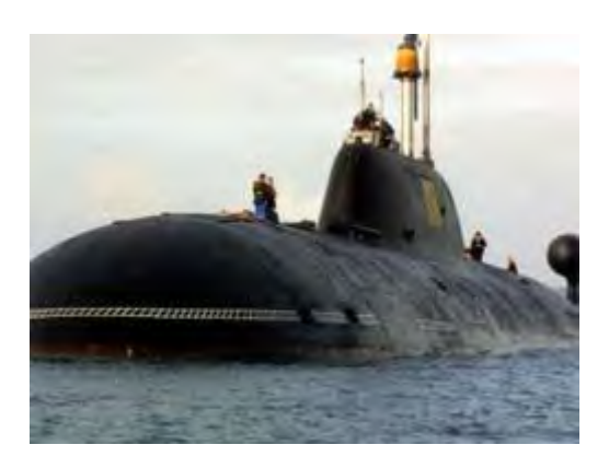
INS Chakra

Refer to the article: Nuclear submarine INS Chakra joins Navy <a href="http://timesofindia.indiatimes.com/india/Nuclear-submarine-INS-Chakra-joins-Navy/articleshow/12530238.cms">http://timesofindia.indiatimes.com/india/Nuclear-submarine-INS-Chakra-joins-Navy/articleshow/12530238.cms</a>