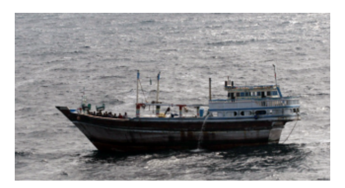
Iranian Fishing Dhow, FV al-Khaliil , apparently used by Pirates as a Mothership