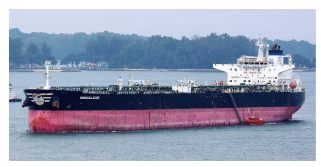
MT Enrica Lexie

Refer to the article: Italian Navy Personnel Kill Two Indian Fishermen <a href="http://neptunemaritimesecurity.posterous.com/italian-navy-personnel-kill-two-indian-fisher">http://neptunemaritimesecurity.posterous.com/italian-navy-personnel-kill-two-indian-fisher</a>