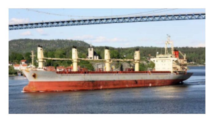
MV Free Goddess

Refer to the article: Piracy Report: Steel-Carrier Captured in Central Arabian Sea <a href="http://gcaptain.com/piracy-report-steel-carrier-central/?39577">http://gcaptain.com/piracy-report-steel-carrier-central/?39577</a>