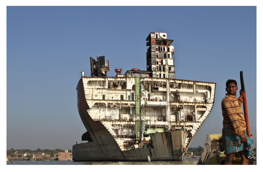
Ship breaking beach in Chittagong

Refer to the article: The Graveyard of Giants: A history of ship breaking in Bangladesh http://gcaptain.com/graveyard-giants-history-ship/?41012