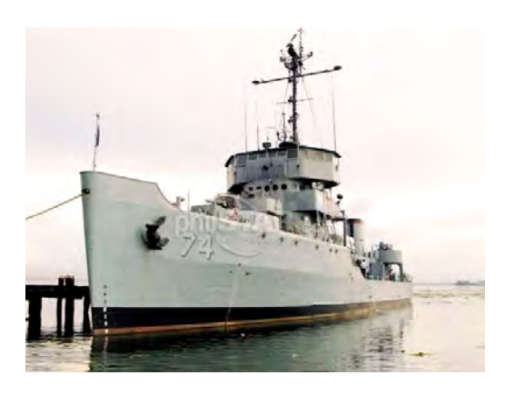
BRP Rizal (PS-74)

Refer to the article: Navy ship scares off Chinese towing boat <a href="http://www.philstar.com/Article.aspx?articleId=738940&publicationSubCategoryId=63&newsalert">http://www.philstar.com/Article.aspx?articleId=738940&publicationSubCategoryId=63&newsalert</a>