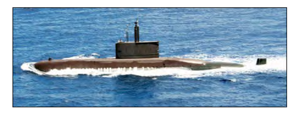
1,300-ton, Type-209 submarine