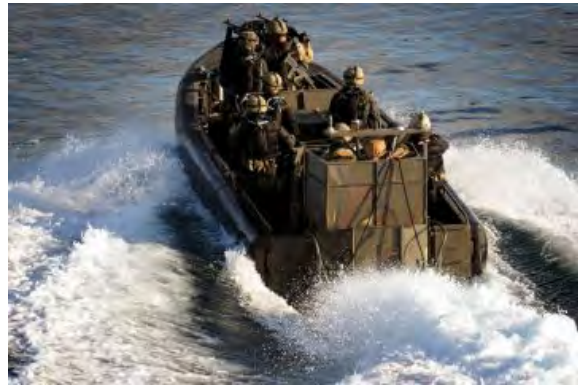
Left: MV Montecristo , Source: Somalia Report, October 10, 2011 Right: British marines approaching MV Montecristo , Source: Global Post, October 12, 2011