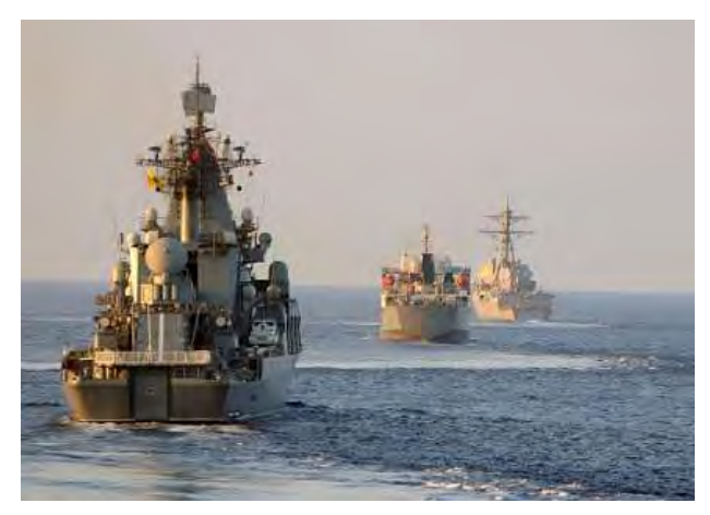
The guided missile destroyer USS McCampbell leads the way during Pacific Eagle, a bilateral exercise with Russian Federation Navy vessels, guided missile cruiser Varyag and the Irkut tanker, and U.S. guided missile destroyer USS Fitzgerald .