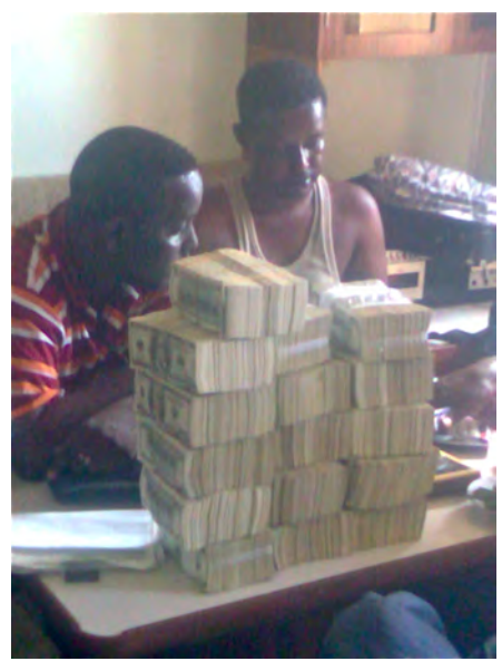
Pirates Dividing Ransom