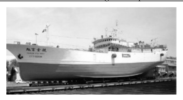
FV Shiuh Fu No 1

Refer to the article: Taiwanese fishing vessel pirated off Madagascar http://www.eunavfor.eu/2010/12/taiwanese-fishing-vessel-pirated-off-madagascar/