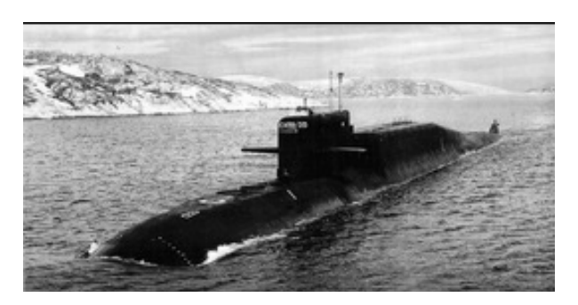
K-407 Novomoskovsk