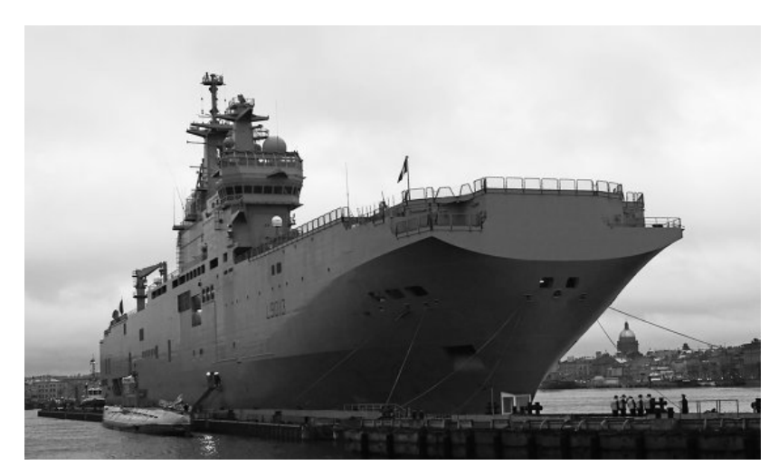
France's Mistral -class helicopter carriers