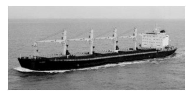
MV Jahan Moni

http://www.dnaindia.com/india/report_navy-ship-rescues-thai-national-thrown-overboard-by-p irates 1477984