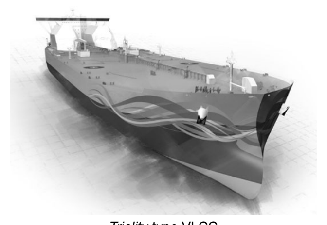
Triality-type VLCC

Refer to the article: DNV unveils concept design for LNG-fueled VLCC <a href="http://www.marinelog.com/DOCS/NEWSMMIX/2010dec00063.html">http://www.marinelog.com/DOCS/NEWSMMIX/2010dec00063.html</a>