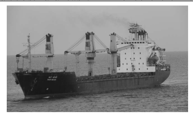
MV Thor Nexus

Refer to the article: Suspected Somali pirates seize Thai-flagged ship <a href="http://af.reuters.com/article/somaliaNews/idAFLDE6BO01020101225">http://af.reuters.com/article/somaliaNews/idAFLDE6BO01020101225</a>