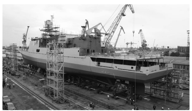
Project 11356 frigate under construction Source: RIA Novosti, December 18, 2010

http://en.rian.ru/russia/20101218/161828394.html