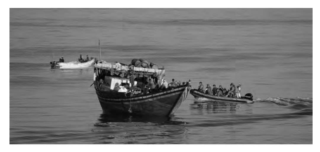
These kind of friendly visits are crucial to collect information about piracy and help create an understanding of EU NAVFOR in the area