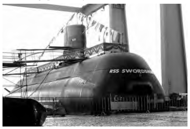
RSS Swordsman

Refer to the article: Singapore Navy Launches Second Archer-Class Submarine <a href="http://www.defencetalk.com/singapore-navy-launches-second-archer-class-submarine-29596/">http://www.defencetalk.com/singapore-navy-launches-second-archer-class-submarine-29596/</a>