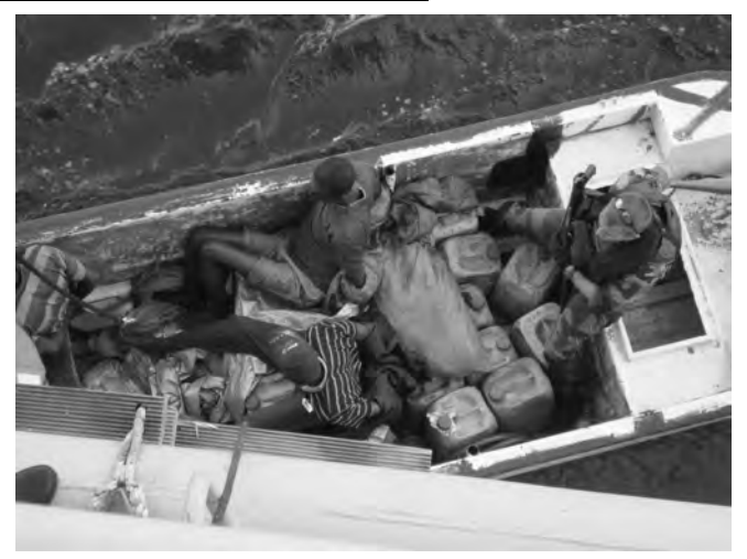
EU NAVFOR Flagship FS De Grasse disrupts a Pirate Action Group

http://www.bbc.co.uk/news/world-africa-11250785