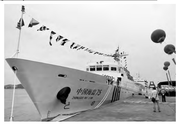
China Marine Surveillance 75