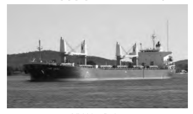
MV Voc Daisy

http://coordination-maree-noire.eu/spip.php?article14107&lang=fi