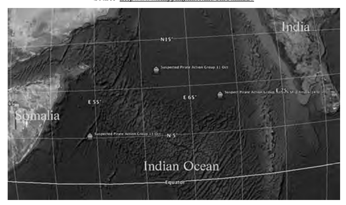
Reported positions of Somali pirate "action groups" as of 13 Oct 10