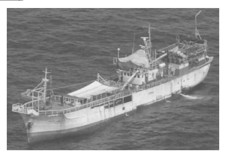
FV Golden Wave

Somali pirates holding South Korean ship <a href="http://www.monstersandcritics.com/news/africa/news/article_1591981.php/Somali-pirates-holding-South-Korean-ship">http://www.monstersandcritics.com/news/africa/news/article_1591981.php/Somali-pirates-holding-South-Korean-ship</a>