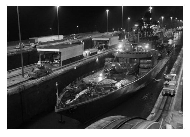
Admiral Chabanenko enters the Gatun Locks on the Panama Canal

Having completed joint naval exercises with the Venezuelan Navy in the Caribbean Sea, Russian Navy's destroyer Admiral Chabanenko passed through the Panama Canal from the Atlantic Ocean to the Pacific Ocean during the night on the 5th. This became the first Russian or Soviet warship to enter the waterway since World War II, including the Soviet era. The Panama Canal was shut to Soviet vessels during the Cold War. The Russian embassy in Panama said the Russian warship's trip through the canal demonstrates to the whole world that the Panama Canal really is a neutral waterway, and there is no other message than that. The Admiral Chabanenko would be docked at the Rodman Naval Station [which is now called the Balboa naval base] from December 6 to 11. The U.S. has not made any comments on the Russian warship's transiting the Panama Canal.