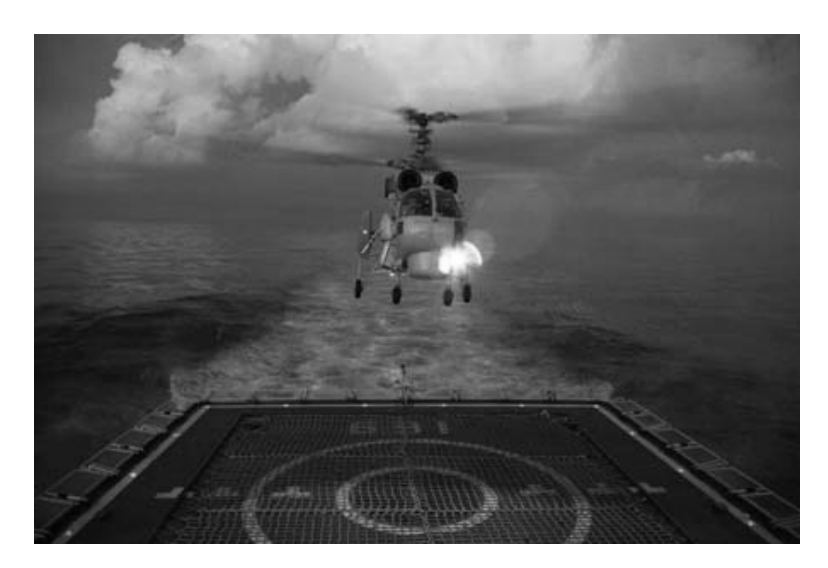
A helicopter of the Chinese naval fleet attends a landing exercise at night on Dec. 28, 2008, while the Chinese naval fleet heads for the Gulf of Aden.

Source: Xinhua, December 29, 2006 <a href="http://english.chinamil.com.cn/site2/special-reports/2008-12/30/content">http://english.chinamil.com.cn/site2/special-reports/2008-12/30/content</a> 1602923.htm