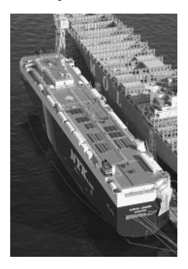
MV Auriga Leader (60,213 DWT)

ratio. The ship, which is capable of carrying 6,400 automobiles, will initially be operated to transport vehicles by the Toyota Motor Corporation.