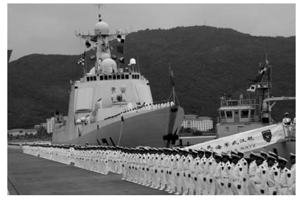
Sail for Escort Mission off Somalia

The Chinese Navy's three-ship fleet set sail to the Gulf of Aden off Somalia from Sanya base in Hainan Province on the 26th. The fleet is composed of two multi-purpose destroyers missile destroyers - DDG-169 Wuhan (6,500 DWT) and DDG-171 Haikou (6,500 DWT), and the supply ship Weishanhu (23,000 DWT). The task force, which carries about 800 crew members, including 70 soldiers from the Navy's special force, will be deployed there for three months. "The expedition will show China's active attitude in maintaining the world's peace and safety," Admiral Wu Shengli, commander of the Navy, told Xinhua at a send-off ceremony before the flotilla departed. "It could also embody the Navy's resolution and capacity to accomplish diversified military missions to deal with multiple threats to national security," the admiral said. The dispatched fleet will protect not only the China-flagged vessels and their crew members but also the vessels of other countries, in addition to the merchant ships with crew members of Hong Kong, Macao and Taiwan on request. (Chinese warships carried out the first escort mission against pirates on January 6, 2009.)