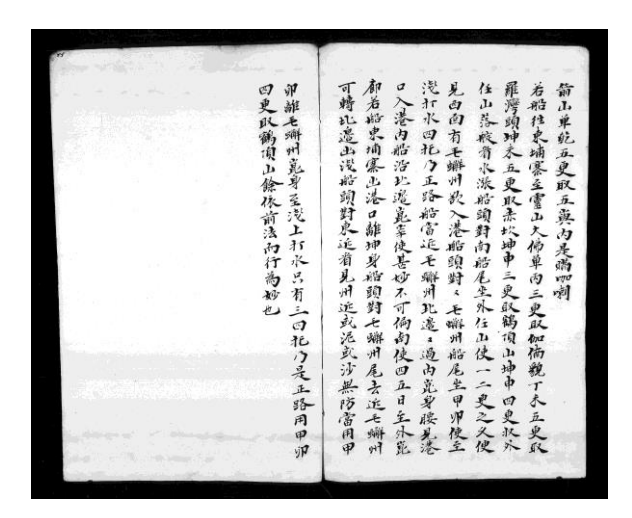
The end of the records of western sea routes in the first section of Voyage with a Tail Wind .

The first section also includes depth measurements for more than 100 locations on western sea routes, while there are only 2 locations for eastern sea routes in the second section. The first section provides the results of many other surveys, including whether the sea bottom is muddy, sandy, or solid, while there is only one similar result in the second section. There are also dozens of measurements in the first section of the North Star and Southern Cross, used to establish latitude, and none at all in the second section. As the sea route for the Senkaku Islands runs west to east, the north-south bearing was always a concern so latitude measurements would have been highly useful, but they are entirely absent. In short, the first section demonstrates Islamic navigation techniques and the second section Chinese navigation. The Oxford manuscript combines writings from two completely different cultures. There is absolutely no connection between the Senkaku Islands, which appear toward the end of the second section, and the year 1403 in the preface.