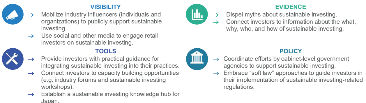
Table 1. Recommendations for addressing barriers to sustainable investing in Japan

There are a series of practical steps that Japan’s financial community can take to start to address each of these challenges, which we list in Table 1 below and detail in the “Recommendations for Action” section of this Agenda . In taking these steps, Japan, with the third-largest economy in the world, can begin to capitalize on increasing momentum for sustainable investing and, in doing so, help investors to promote social, environmental, and financial sustainability.