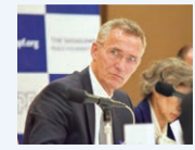
NATO Secretary General Stoltenberg listens to remarks by a Japanese participant (October 2017)

facilitates discussions that transcend participants’ official capacities. For this reason, it is considered especially effective in promoting mutual understanding and building trust. The SPF will continue to provide venues for dialogue on diplomacy and security issues.