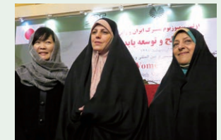
The international symposium titled "Women, Peace and Sustainable Development," held in Teheran

With Iran making a full-scale return to international society, this project assists in preparing for an environment whereby Iran can exert its full potential in various areas, and contribute to regional/world peace, stability and development as a major power in the Middle East.