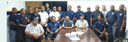
1 Gathering with trainees who completed the Human Resource Enhancement training for Coast Guard in Japan (Palau) / As part of the "Enhancing Human Resources for Maritime Security in the Micronesia Region" project, 15 trainees (OJT) of Palau's Maritime Law Enforcement Division underwent training at the Maritime Technical College (Ashiya City, Hyogo Prefecture).

This project promotes Second Track Diplomacy, led by the SPF, to deepen Japanese people's understanding of Pacific island nations, and issues practical recommendations for addressing new challenges of the Pacific island countries and its region, thereby reinforcing ties between Japan and Pacific island nations.