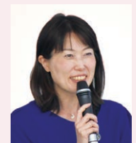
Astronaut Naoko Yamazaki speaking at the Gender Assessment Workshop in May 2017.