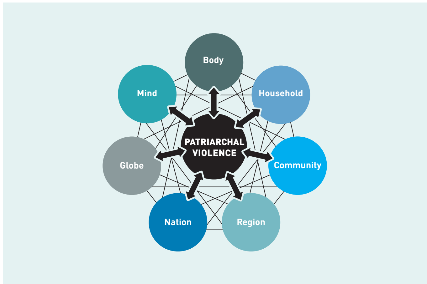
FIGURE 1: CONTINUUM OF VIOLENCE

In all three regions, women and men agree that good governance and overcoming poverty have not yet been achieved, and acknowledge that these issues were core drivers of the conflict. The politics of power-sharing by elites and political leaders – primarily men formerly in armed groups – dictated whether communities received support or were sidelined in the post-conflict political transition. This research shows that a focus on security and economic development did not resolve the underlying drivers of violence, nor work directly with the key stakeholders (families, clans and religious leaders) that underpin gender unequal behaviours and militarized masculinities.