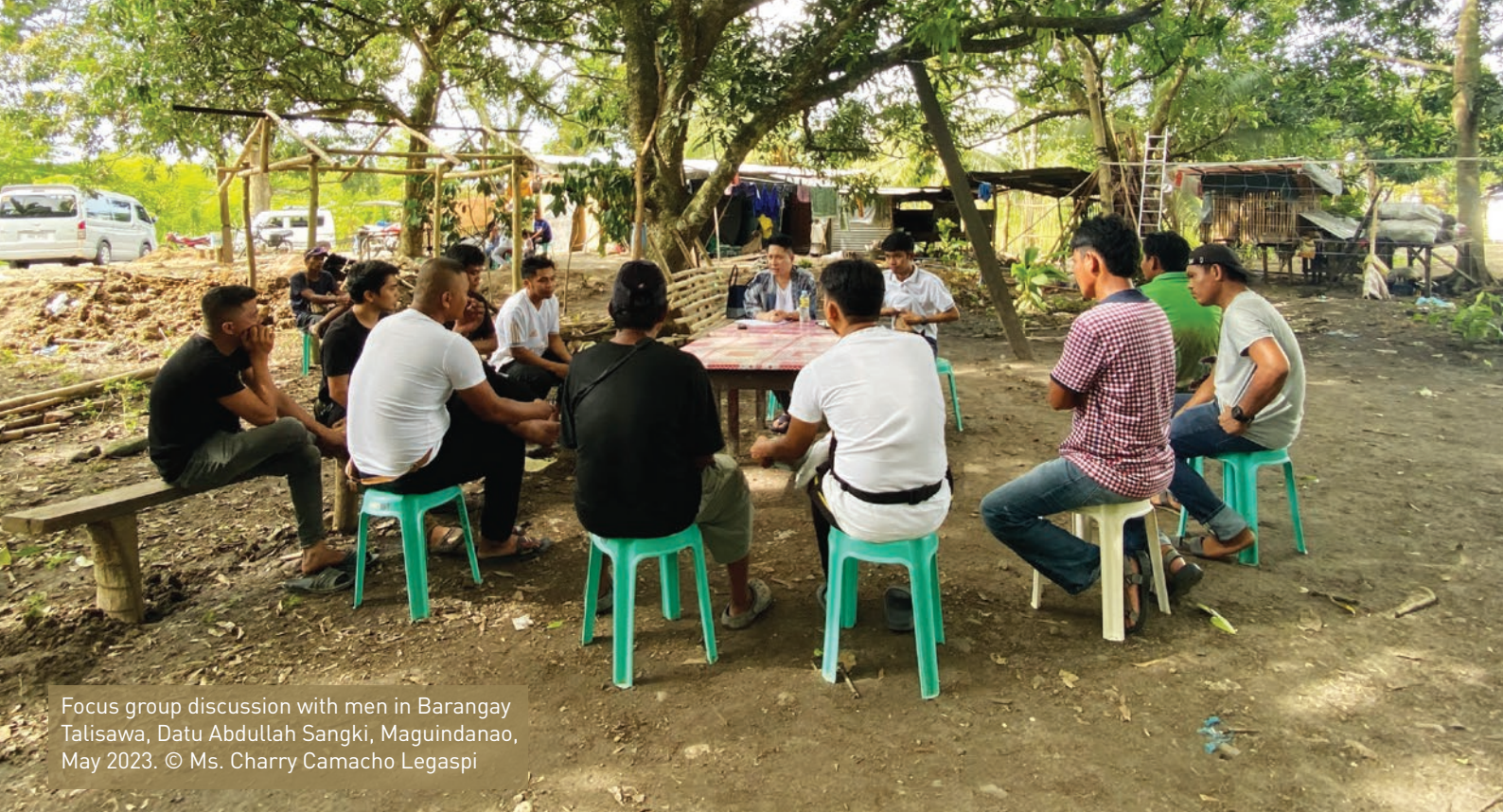
Focus group discussion with men in Barangay Talisawa, Datu Abdullah Sangki, Maguindanao, May 2023.

Importantly, however, women rarely openly or visibly claim these leadership roles. Women may refrain from publicly highlighting their interest or ability to perform socially prescribed male roles because this may undermine the limited power they do hold. They may also prefer to publicly endorse traditional gender norms for reasons of personal safety, community cohesion and to uphold family honor.