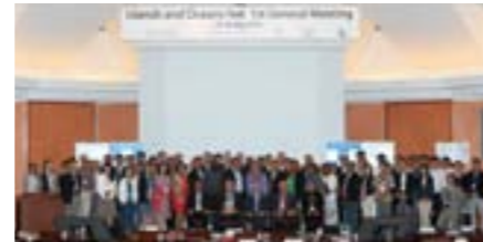
1st General Meeting of the IO Net