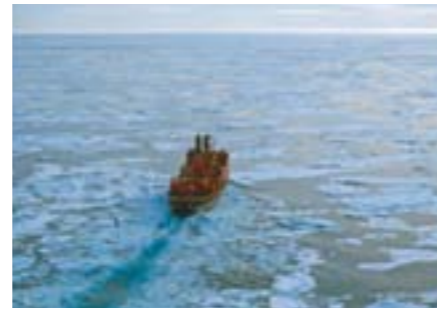
Arctic Ocean ice decline in recent years