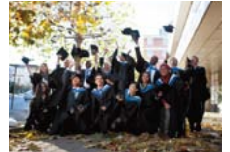
WMU graduation photograph