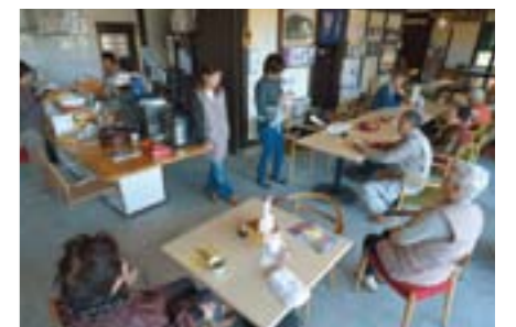
'Ibasho House' in Matsusaki Town, Ofunato City, Iwate Prefecture

Rapid population aging is now emerging as a major social issue in Asia. Many studies have been conducted on its impact on social security. This project is aimed at utilizing the studies' findings and compiling policy recommendations as to how these countries can prepare themselves for an aging society. This fiscal year, eight experts exchanged opinions in committee meetings, while a fact-finding mission was sent to Thailand and the Philippines to look into population aging and social security in those countries. The GFF exchanged opinions with local stakeholders about the progress of research into aging society, and invited external lecturers for study sessions. In the future, the project on Asia's population aging will expand its target from the current Thailand, the Philippines and Vietnam to China, and South Korea, where poverty is emerging as a social issue. The project is to place its emphasis on formulating proactive measures to address population aging, e.g. developing a community-level initiative to attenuate dementia. In August 2016, the GFF decided to launch a feature page within the nippon.com website to disseminate information about aging society.