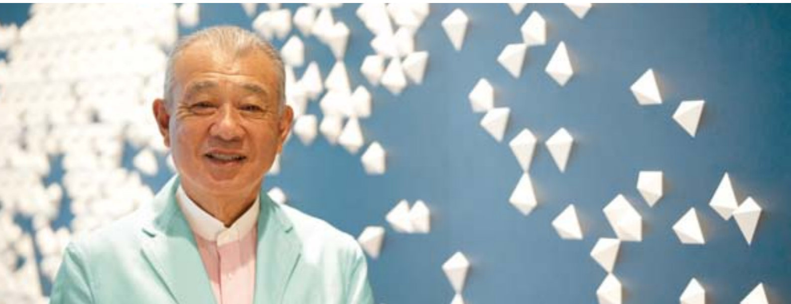
Honorary Chairman Yohei Sasakawa