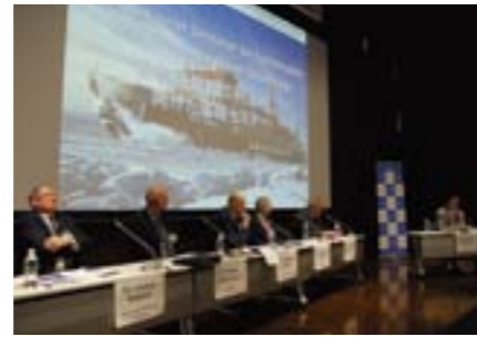
Seminar on sustainable use of the Northern Sea Route