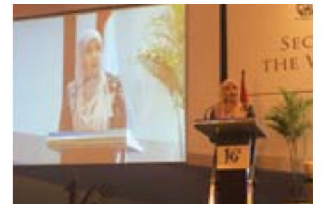
Malaysia's female member of Parliament, Nurul Izzah Anwar

In order to address the emergence of Islam extremists, this project provides a platform for dialogue on 'Muslim democrats,' i.e. moderate Muslims who embraces the principle of democracy into the teachings of Islam, with the aim of helping the Muslim world identify policy issues that must be resolved. In November 2015, the GFF collaborated with the Habibie Center (Indonesia), Malaysia's Institute for Policy Research (IKD, Malaysia) and Turkey's Foundation for Political, Economic and Social Research (SETA, Turkey) to co-host the second World Forum for Muslim Democrats in Jakarta to facilitate in-depth debate between Muslims and non-Muslims and promote mutual understanding and dialogue between East and West Asia. The SPF used its strong network to secure the participation of experts from Iran to bring about rare debates transcending religious barriers between the Sunni and Shia Muslims. Participants actively exchanged opinions on a range of international issues surrounding the Muslim world, including the democratization of Muslim nations, issues arising from the so-called Islamic State, acceptance of ever-increasing refugees, promotion of mutual understanding between Muslims and non-Muslims, social justice and legal standards.