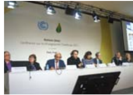
Recommendations to official participants of COP21