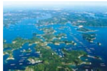
Ago Bay, Shima City, undertaking development of ICM with a concept of "new Satoumi"