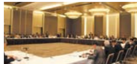
Basic Ocean Act Strategy Forum, widely participated in by experts

The Global Frontier Fund was established following the merger of the Sasakawa Peace Foundation and the Ship and Ocean Foundation (a.k.a. Ocean Policy Research Foundation) on April 1, 2015. It aims to further develop projects that were handled by the two foundations since their establishment, while also taking on new projects not limited to specific regions with fresh perspectives and foresight, so as to become the post-merger SPF's new operational axis.