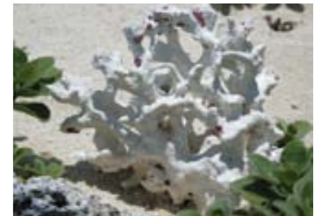
Bleached and beached coral