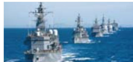
Maritime security