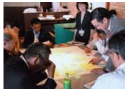
Study Session at a Model Site