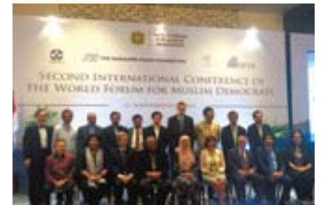
The Forum in progress in Jakarta