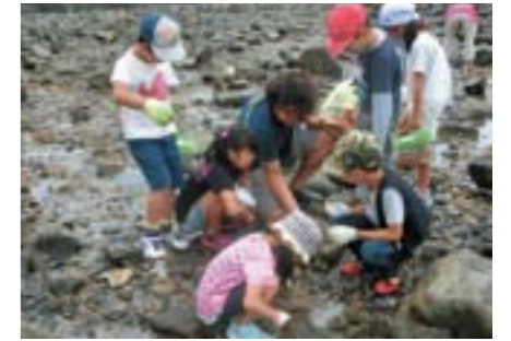
Field trips to learn about marine life on the beach