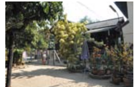
Farming village in Chiang Mai, northern Thailand