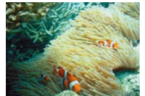
Ocean, home to diverse forms of marine life