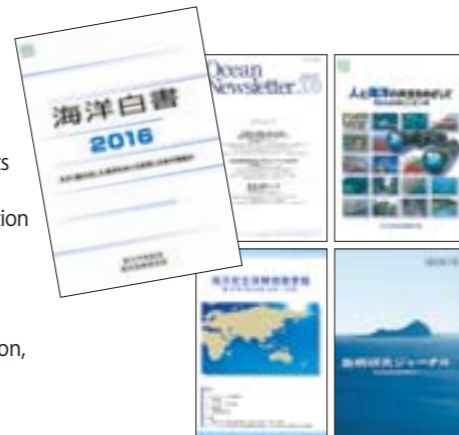
Publications issued under the ocean information dissemination program